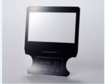
Displays for automobiles